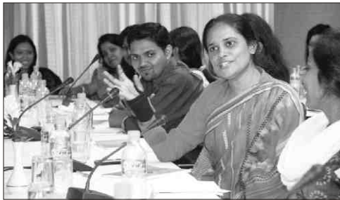
A participant joins the discussion

One participant pointed out that people who tend to undermine sexuality's central location in maintaining structures of inequality lack a clear and deep understanding of sexuality. This limits their ability to connect sexuality with wider social issues, thus bringing up the question of its relevance in discussions of development and human rights. Therefore, part of our work is to educate ourselves and others and make these connections clear.