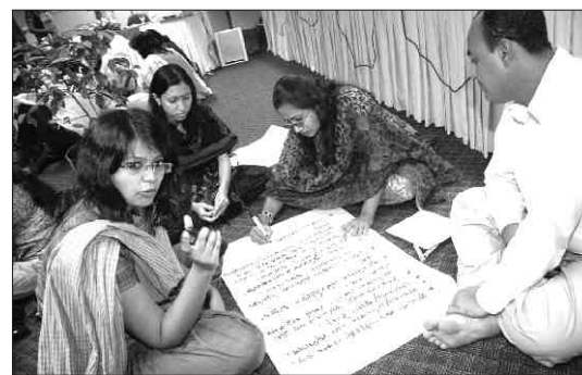
Participants work in groups

The last activity of the workshop divided participants into small groups to brainstorm on future strategies to take our work with sexuality and rights forward collectively and identify ways the Centre can provide support to these efforts. Participants identified what they viewed as our most pressing needs and possible ways of addressing them: