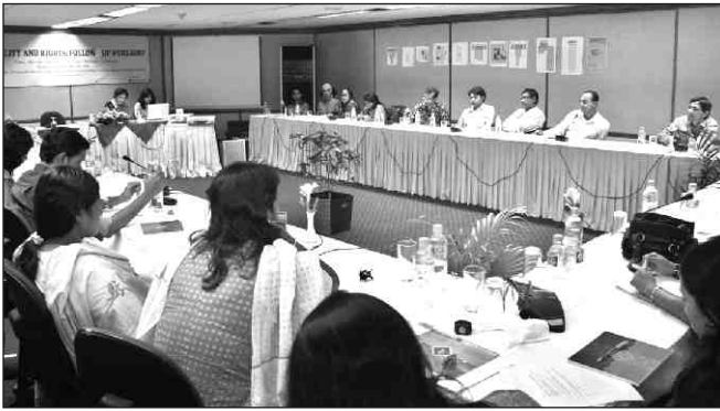
Participants at the workshop

exchanges and plans are not followed up on. This undermines the potential for continued strategizing and action. Participants expressed appreciation for the Centre's continuing engagement with them after the initial workshops.